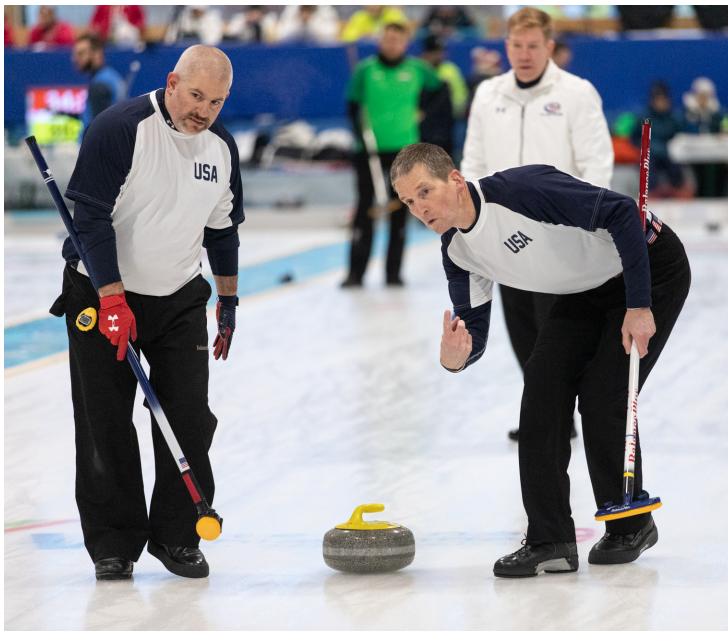
USA Deaf Curling takes on Hungary during the 19th Winter Deaflympics on Wednesday Dec 18, 2019 in Madesimo, Italy.